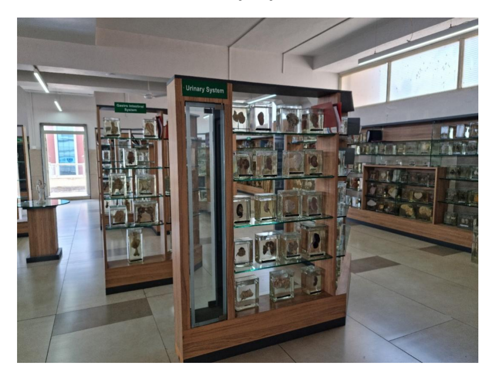
Spleen and Lymphnode