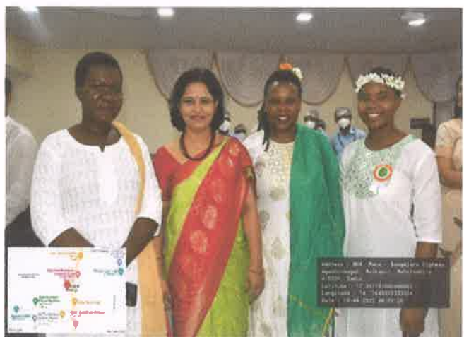
Participated in celebration of Independence Day on 15 th August, 2022