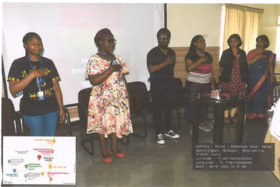
Malawi National Day Celebration