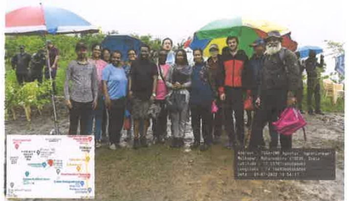
Participated in Tree Plantation Program organized by KIMS University on 9 th July, 2022.