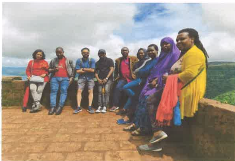
Short Trips to Mahabaleshwar, Ozarde & Patan