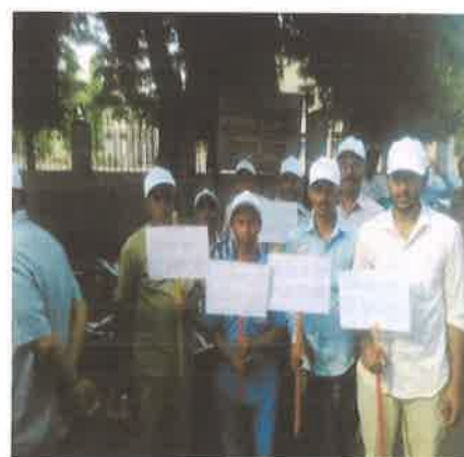
Photograph 6_WED Participants