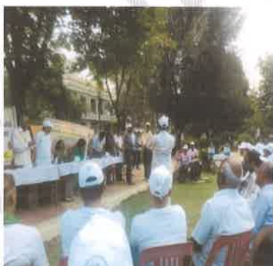
Photograph 5_WED Appreciation of participants

World Environment Day (WED) is observed worldwide on 5 th June. KIMSDU also celebrates WED with participation of staff and stakeholders. Various programs are organised on the day such as seminars, plantations, cycle rally etc.