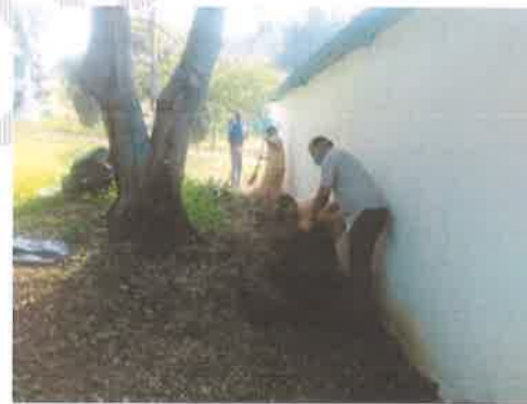
Photograph 4_Cleaning Drive