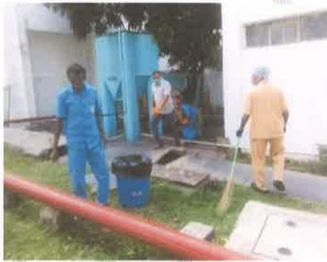
Photograph 3_Cleaning Drive