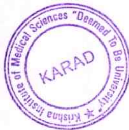
Secretary, Fee Concession Committee.