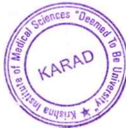
Secretary, Fee Concession Committee.