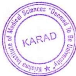
Secretary, Fee Concession Committee.