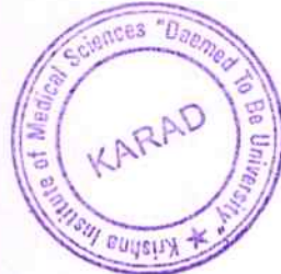
Secretary, Fee Concession Committee.