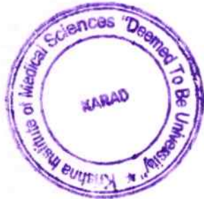
Secretary, Fee Concession Committee.