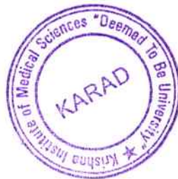
Secretary, Fee Concession Committee.