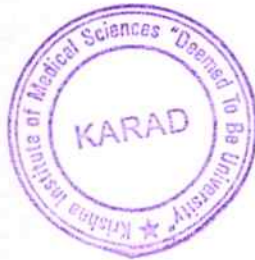
Secretary, Fee Concession Committee.